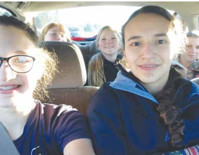
Our youth on the way to the Kalahari Resort for last year's Frassati Fest

Do you have a “favorite” saint – one whose personal faith journey and response to God’s love inspires your own faith and relationship with God?