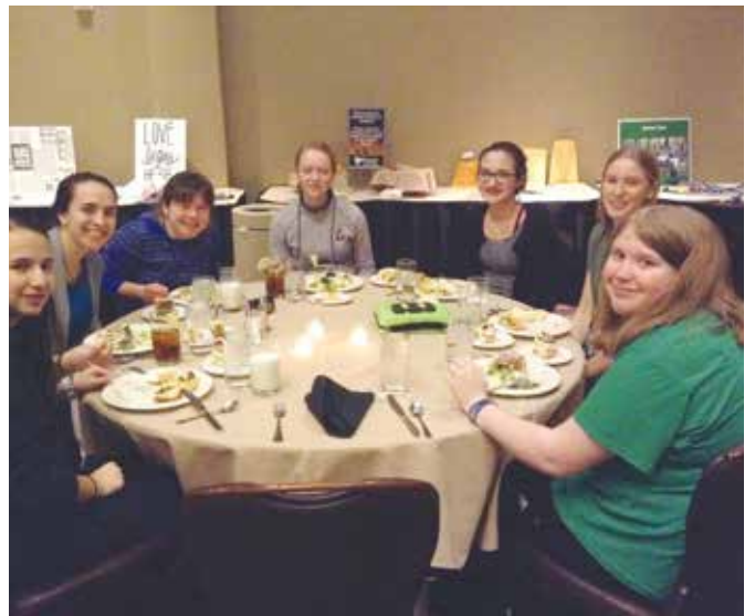
The Frassati Fest is packed with fun games, great talks, delicious food, and deep prayer.