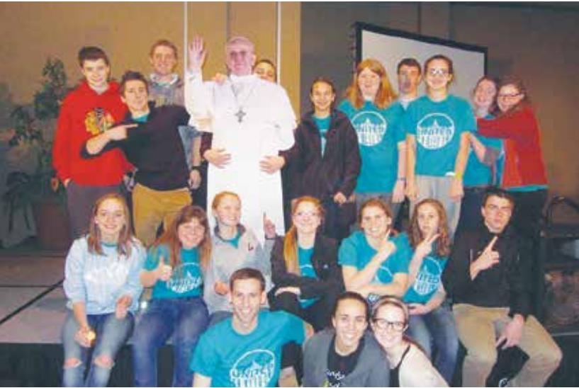
The Frassati Fest provides an opportunity for the youth of our parish to connect with Christ and their peers in a social setting.